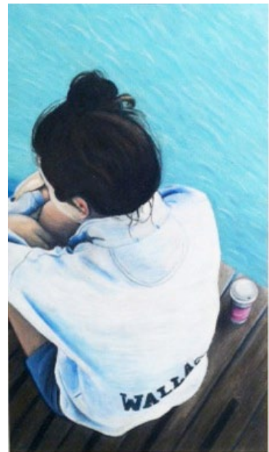
Hannah Good 'Gas Station Coffee' Oil Pastels