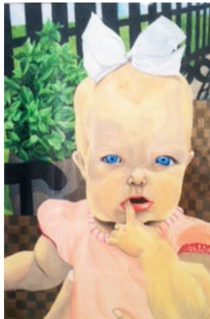
Hope Thelen 'Baby' Colored Pencil