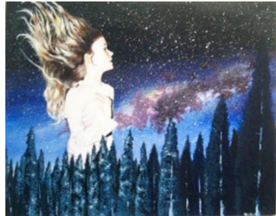
Gina Erardi 'Nostalgia Runs the Night' - 2nd Place Acrylic